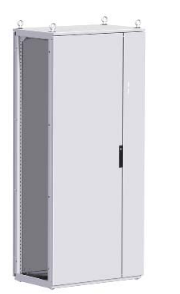
HFMD - 1DR